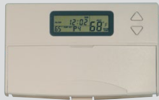
EP-3 Series Electronic Programmable Thermostat