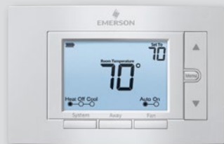
1F85U Series Electronic Multi-Stage Programmable Non-Programmable Thermostats

Control Range: 44° to 95°F (7°C - 35°C) Heating Unit Switch: E - Fan controlled by thermostat; G - Fan controlled by heating unit System Switch: 3 position (COOL - OFF - HEAT) Fan Switch: 2 position (ON - AUTO)